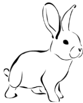
LIZ WATSON MEMORIAL PROJECT Sponsored by: The Liz Watson Family

The award recipient will receive a trophy and $25.